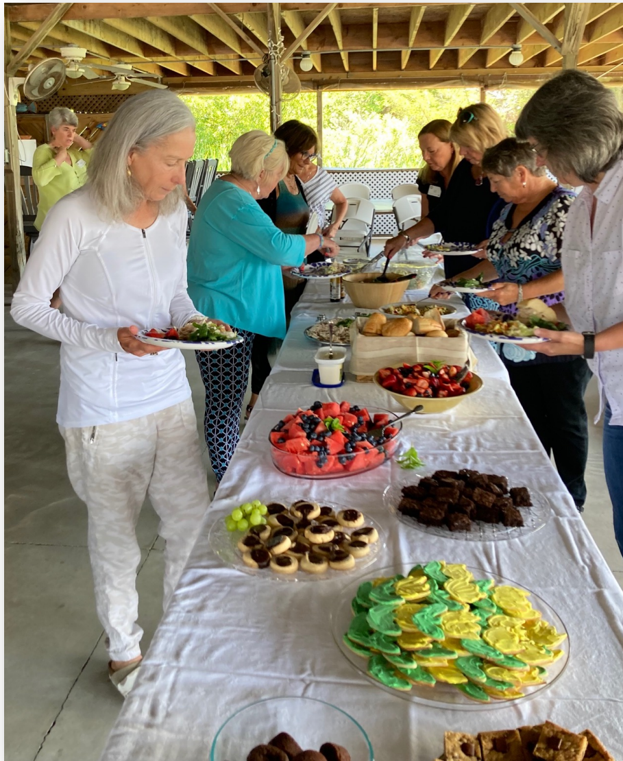
June Luncheon Meeting