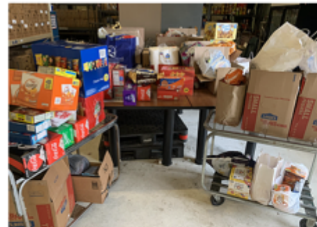
Donations collected for USO Dover canteen. All canteen items provided to service members at no charge.