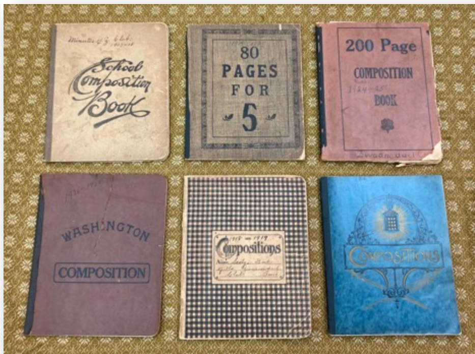
Meeting minute books from the early part of the 20 th century.

Membership in 1940 was at 40 members. Membership declined to 24 in 1947 but increased again to 49 members in 1949. It is possible that the club did not meet often for a number of years.