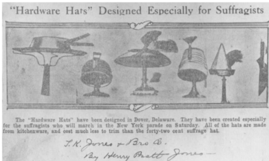
Hardware Hats for Suffragists